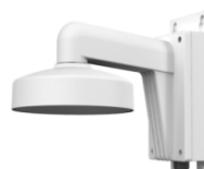
DS-1273ZJ-135B Wall mount with Junction box