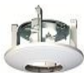
DS-1227ZJ In-ceiling mount